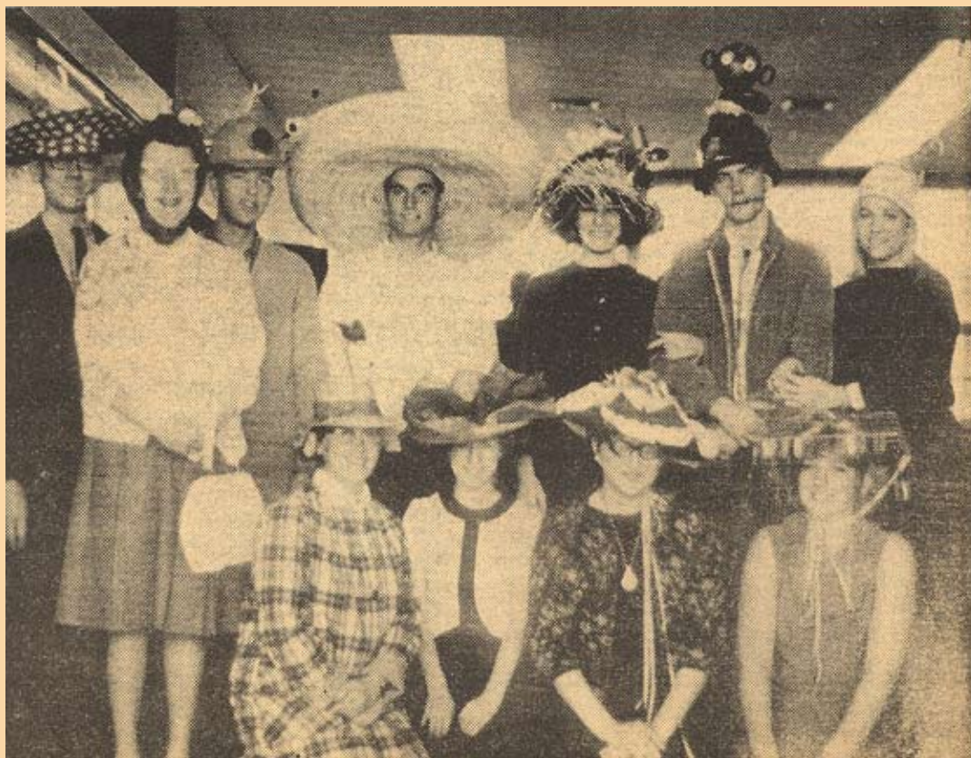
Crazy Hats Day was held Wednesday, March 2. A few of the catastrophic monstrosities are shown here.